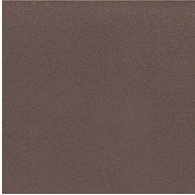
Rusty Rush - 10